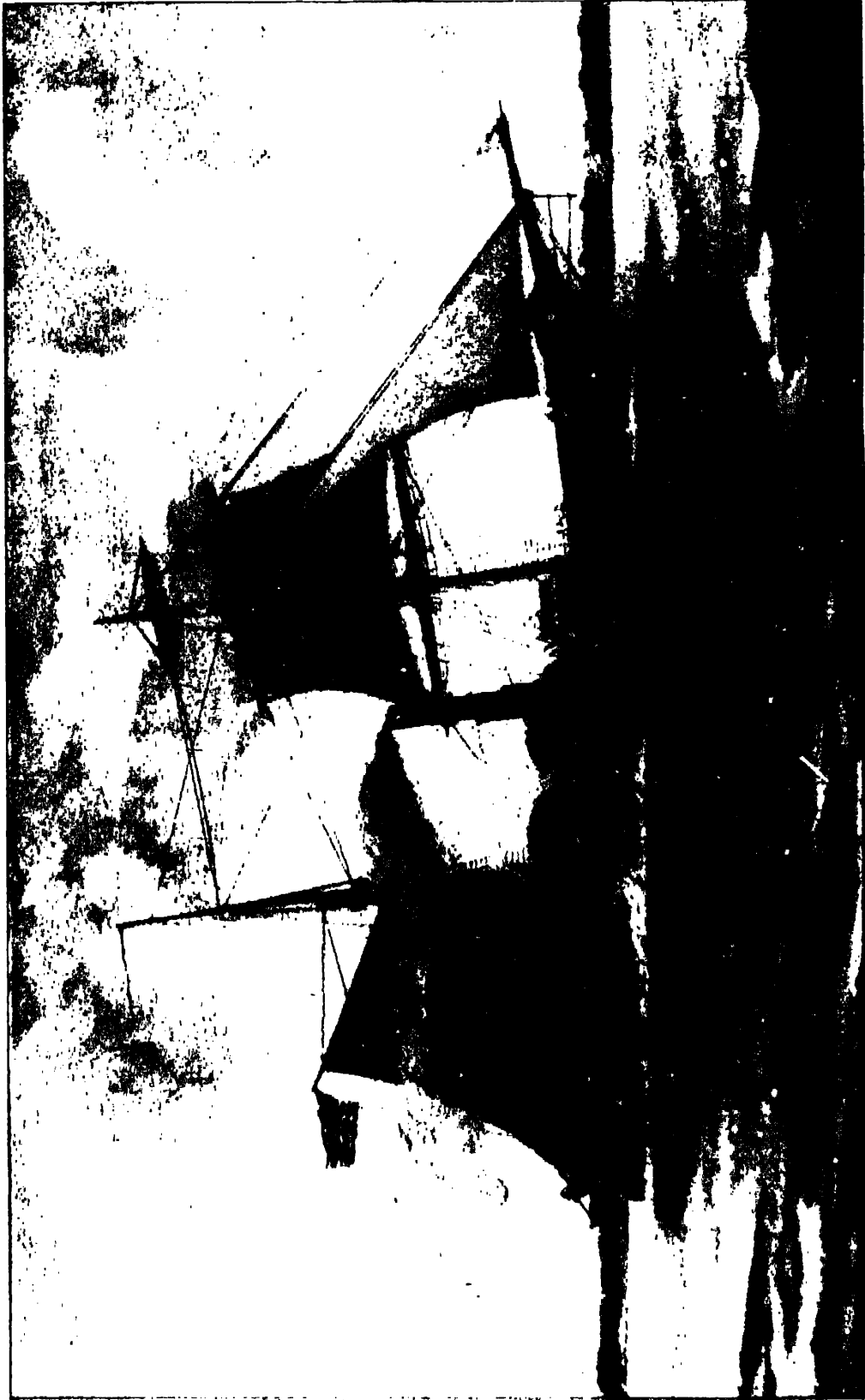
UNITED STATES STEAMER HARRIET LANE.