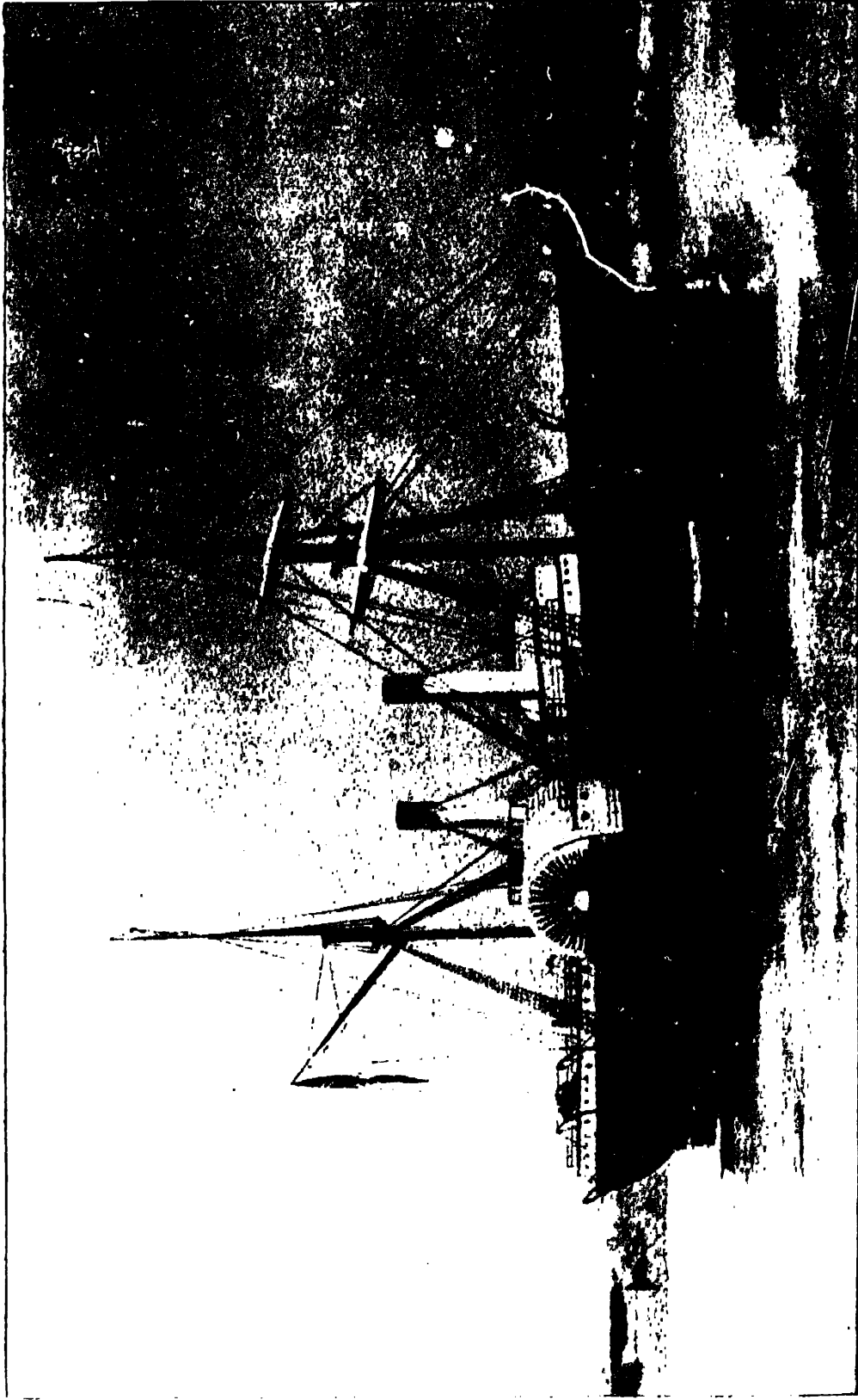
UNITED STATES STEAMER QUAKER CITY.