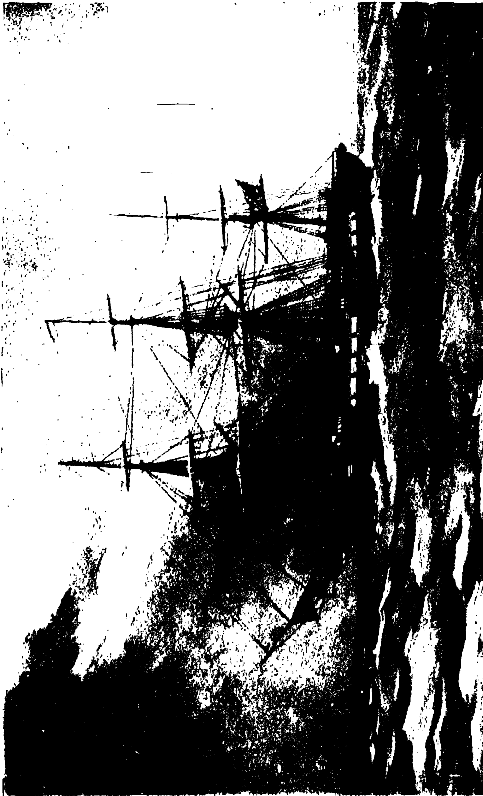
UNITED STATES STEAMER MINNESOTA.